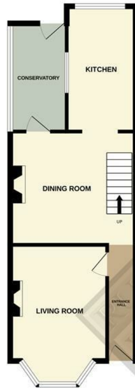
GROUND FLOOR 483 sq.ft. (44.8 sq.m.) approx.