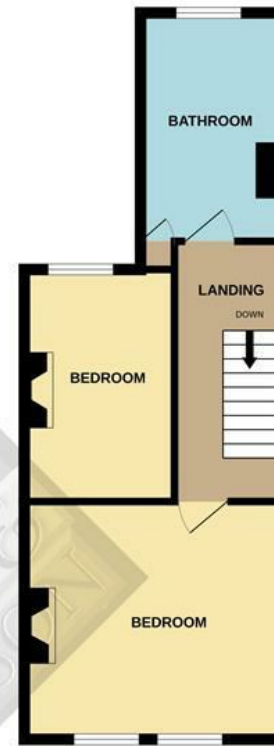
1ST FLOOR 397 sq.ft. (36.9 sq.m.) approx.